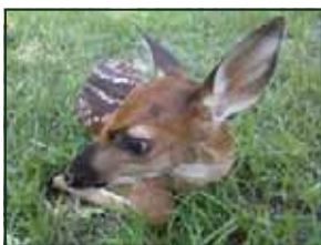
Fawn at Reynolds' Farm

PRSR STD U.S. POSTAGE PAID MAGNOLIA, AR PERMIT NO. 22