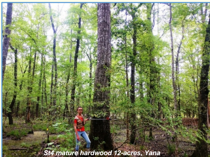
St4 mature hardwood 12-acres, Yana