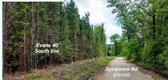
Evans 40 South line