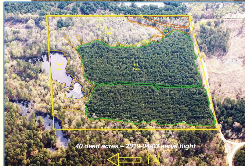
40 deed acres - 2019-04-03 aerial flight

...more details at reynoldsforestry.com select 'Evans 40 acres' in Land sales