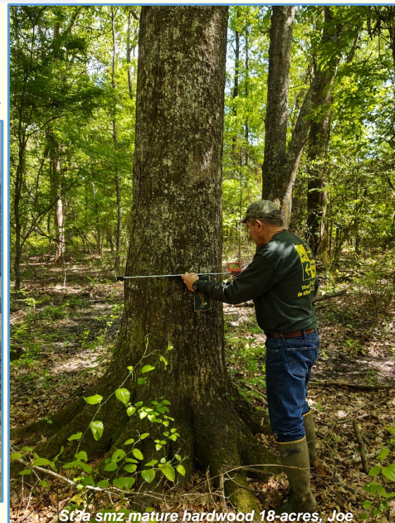
St3a smz mature hardwood 18-acres, Joe

...more details in Land Sales reynoldsforestry.com select 'Bodcaw 265-acres'